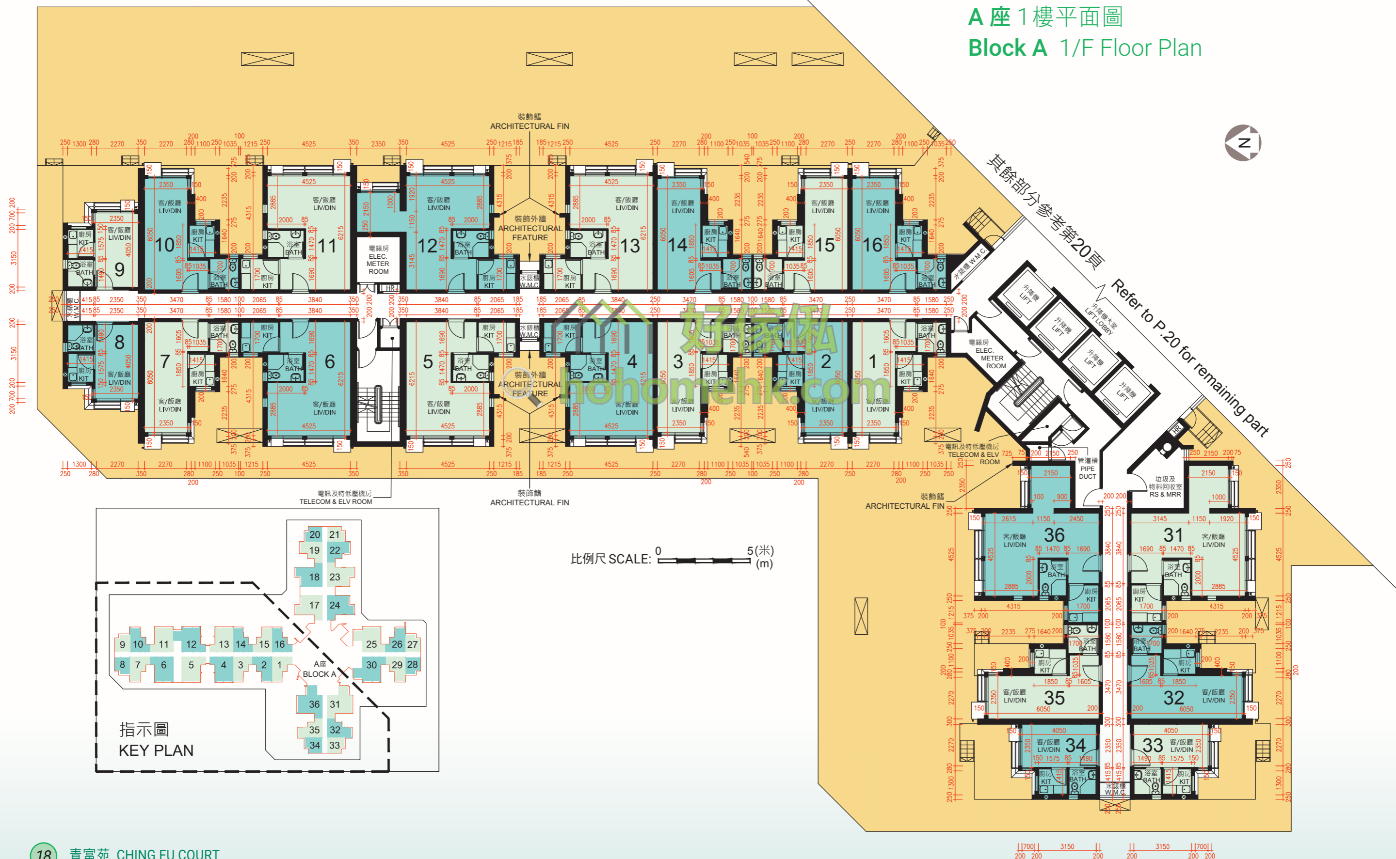
Block A 1/F Floor Plan